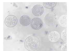
Electron micrograph of several multilayered liposomes.